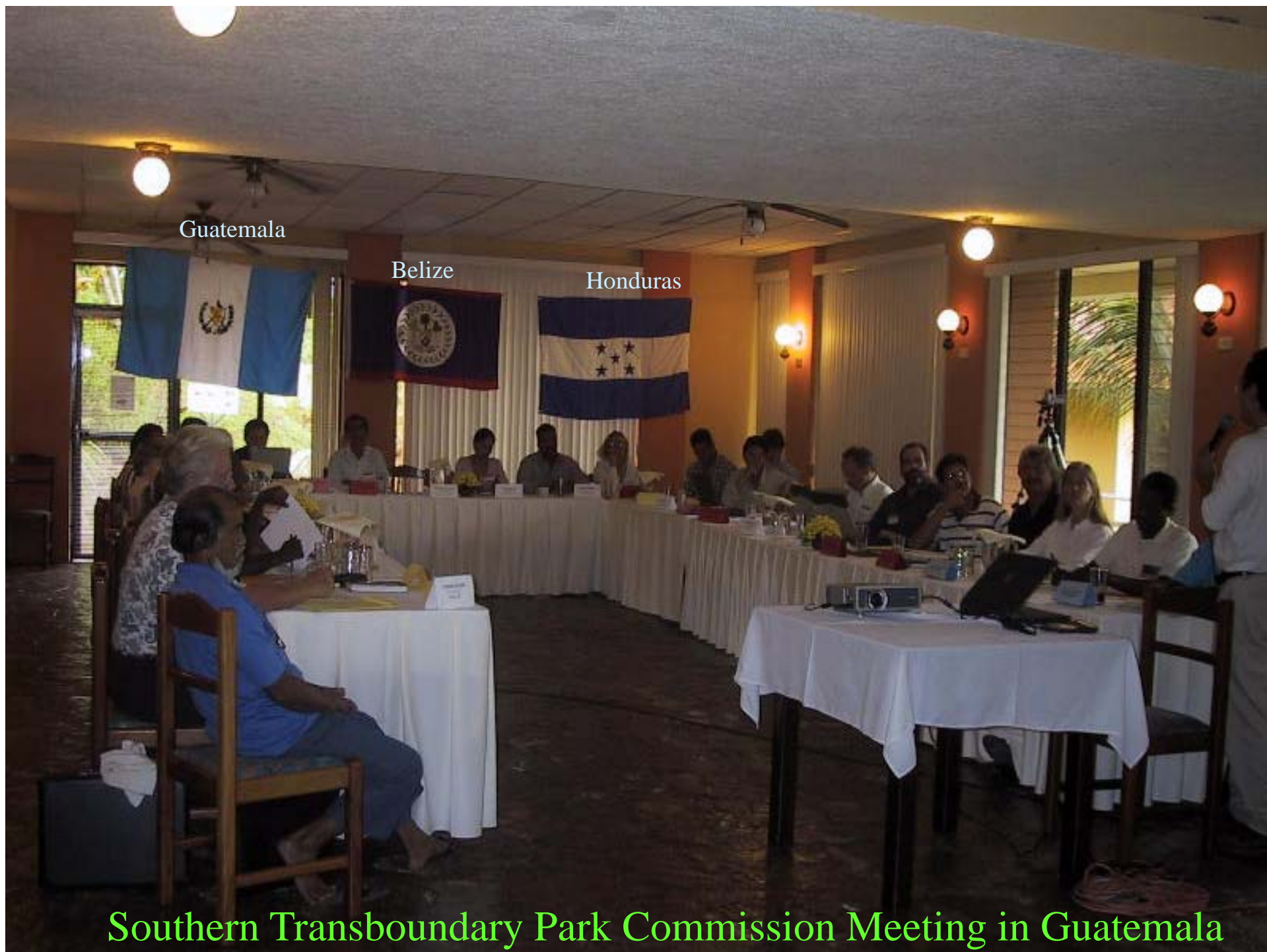
Southern Transboundary Park Commission Meeting in Guatemala